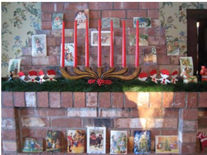
Dala horses and tomtens add to the traditional cards and candelabra decorations at Oscar Anderson House Museum during Swedish Holidays.

Please join AAHP volunteers, members, and board members for a Swedish-themed holiday the first two weekends of December.