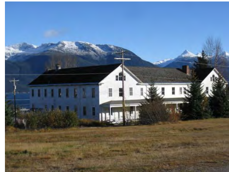
Flashing was installed around the 480 foot perimeter of the roof at the Barracks Building, Fort William H. Seward, in summer 2016.

The second grant of $2,500 was awarded to the Port Chilkoot Company for installation of flashing on the roof of the Barracks Building, Fort William H. Seward, in Haines. This will protect the roof and siding until major repairs can be done in the future. This grant project is complete.