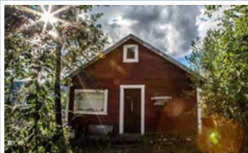
The Kate Kennedy House in McCarthy

The 2016 Ten Most Endangered Historic Properties grant has been awarded by the Alaska Association for Historic Preservation (AAHP) to the McCarthy-Kennicott Historical Museum for the Kate Kennedy House in McCarthy. The $2,500 grant will help with stabilization of the early 20th-century wood framed dwelling, providing functional space for the museum as well as supporting the preservation of this cultural resource.