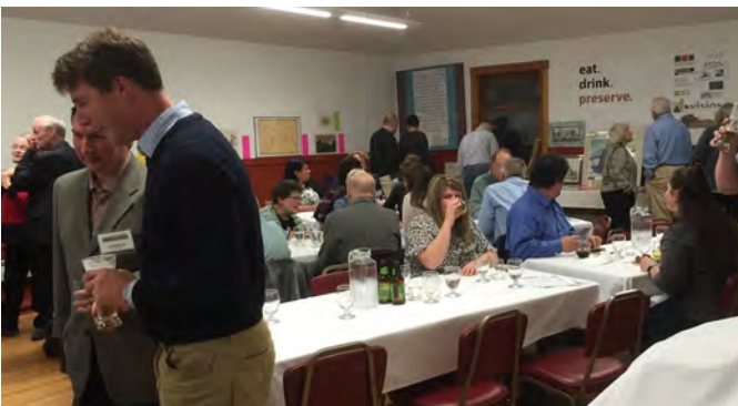
Attendees at the October 8 dinner enjoy food, an architectural challenge, and a successful silent auction.

AAHP looks forward to 2017 with gratitude for the support given and with excitement for things to come!