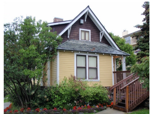
The Oscar Anderson House Museum

Although now closed for the summer, it will be open for tours during the first two week-ends of December to celebrate Swedish Holidays, honoring the heritage of the Oscar Anderson family. More details to come at http://www.aahp-online.net/oscar-anderson-house-museum.html .