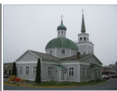
St. Michael's Cathedral