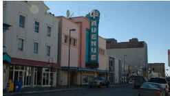
4th Avenue Theatre

AAHP's 10 Most Endangered Historic Properties for 2016 are in the spotlight with recent television, newspaper, and radio coverage.