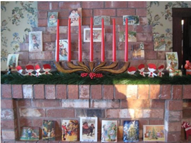
Tomtens and Dala horses peek out from among the other decorations to greet visitors during Swedish Holidays in December at the Oscar Anderson House Museum.

Please join AAHP volunteers, members, and board members for a Swedish-themed holiday the first two weekends of December.