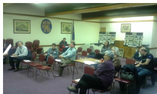
Last year's Annual Meeting