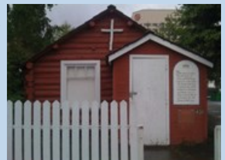
Anchorage's Berg-Brown Cabin, built in 1916, is no more.

The Berg-Brown Cabin, located on 4th Avenue in downtown Anchorage, was built in 1916 and, until recently, was one of the oldest existing buildings in the city. The Anchorage Historic Preservation Commission and AAHP made repeated attempts to contact the property owners with an offer to move the cabin off the property and relocate it in order to preserve it, but no response was ever received. Instead, one day last fall, the building was simply no longer there . . .