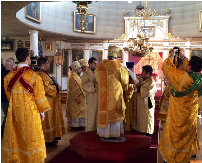
The consecration and installation ceremony of the Bishop