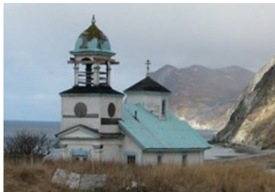
Ascension of Our Lord Chapel in Karluk