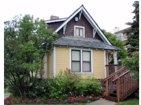
The Oscar Anderson House Museum

AAHP extends a heartfelt thank you to our wonderful volunteer tour guides, who make these tours possible.