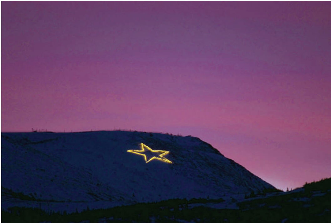
On March 17, 2013, when the last musher of the 2013 Iditarod Trail Sled Dog Race was safe in Nome, the Arctic Valley Star was switched off for another year.

Visible from all over Anchorage and across Cook Inlet, the Arctic Valley Star located on Mt. Gordon Lyon has been an icon in Alaska's largest city for decades. The 300' x 300' star, lit by 350 60 watt light bulbs, is turned on the day after Thanksgiving each year and is turned off when the last Iditarod musher comes into Nome each March.