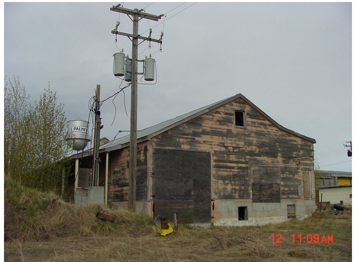
Colony Project Warehouse c. 2010

We are saddened to report that a fire has destroyed the Matanuska Maid Block Building, commonly known at the “Colony Project Warehouse”. Built in ca. 1935, the warehouse was part of the former Mat-Maid Cooperating Association. It stood within the Colony Project Historic District. The building was used for the dairy industry and as a vegetable market, and later housed a hardware store.