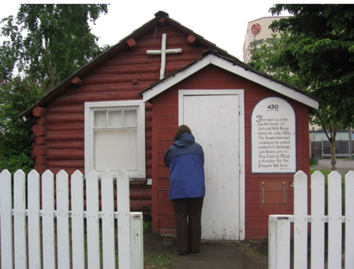
The Berg-Brown Cabin (430 E. 4 th Ave.) was listed on AAHP's 2012 10 Most Endangered Properties list