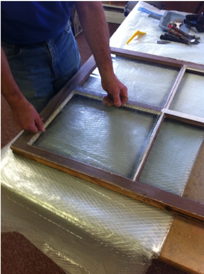
Don Corwin repairs a Pioneer Schoolhouse window by replacing a pane of glass