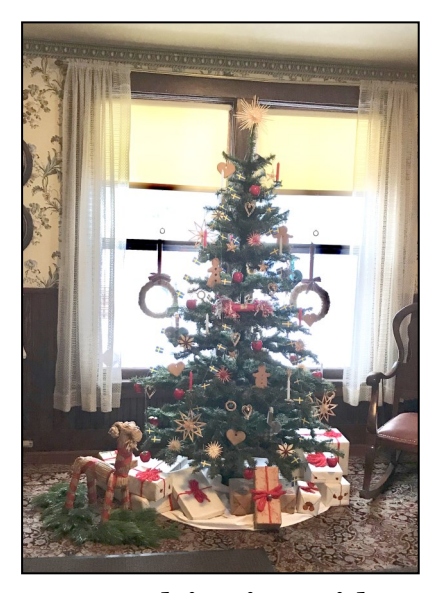
Step Back in Time with Anchorage's only Historic House Museum!