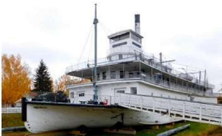
The Steamer Nenana is the last remaining sternwheeler in Alaska and is believed to be the last of her kind in the United States.